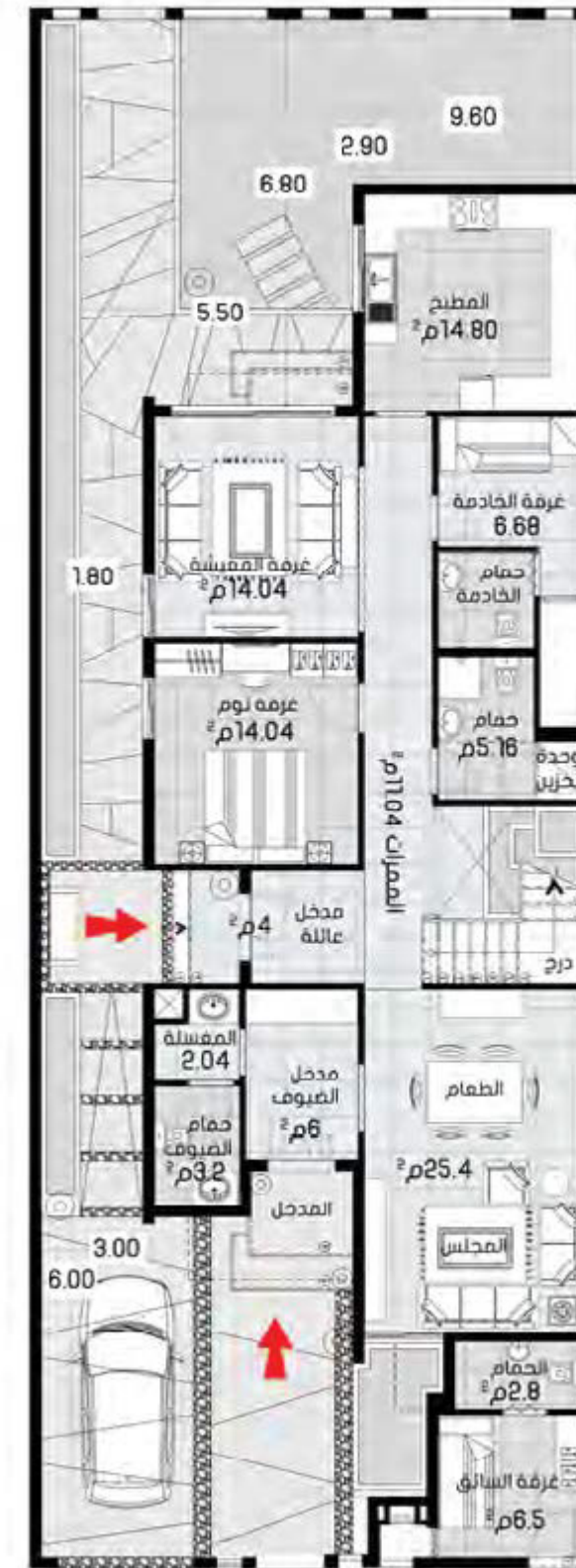
Ground Floor 155 m 2