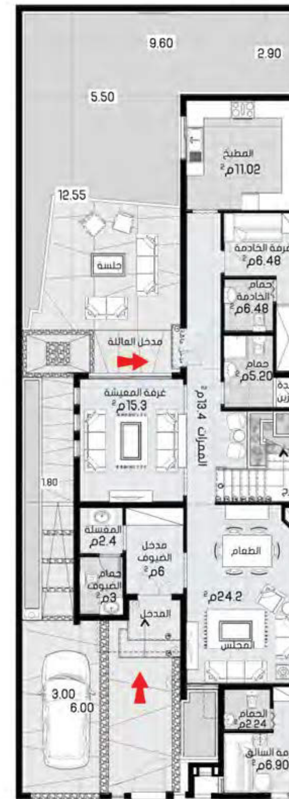
Ground Floor 132 m 2