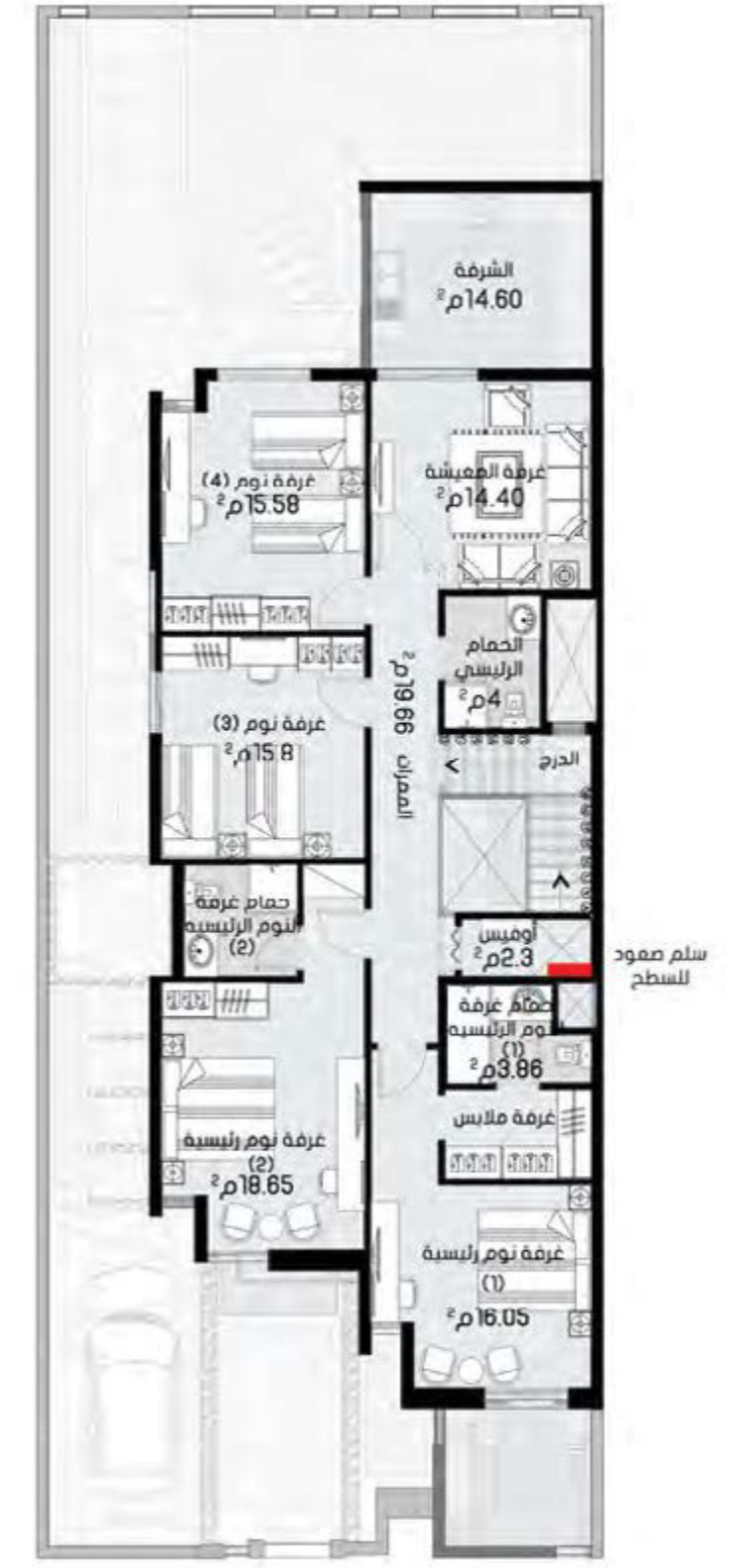
First Floor 128 m 2