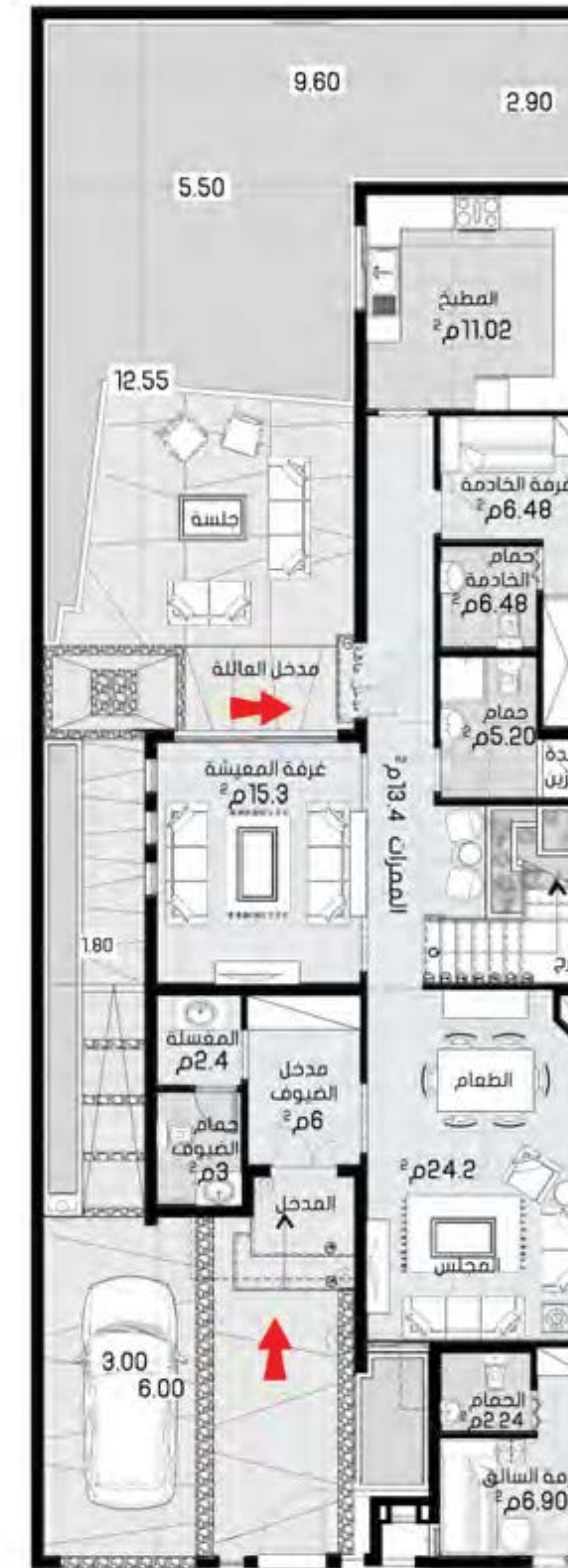
Ground Floor 132 m 2