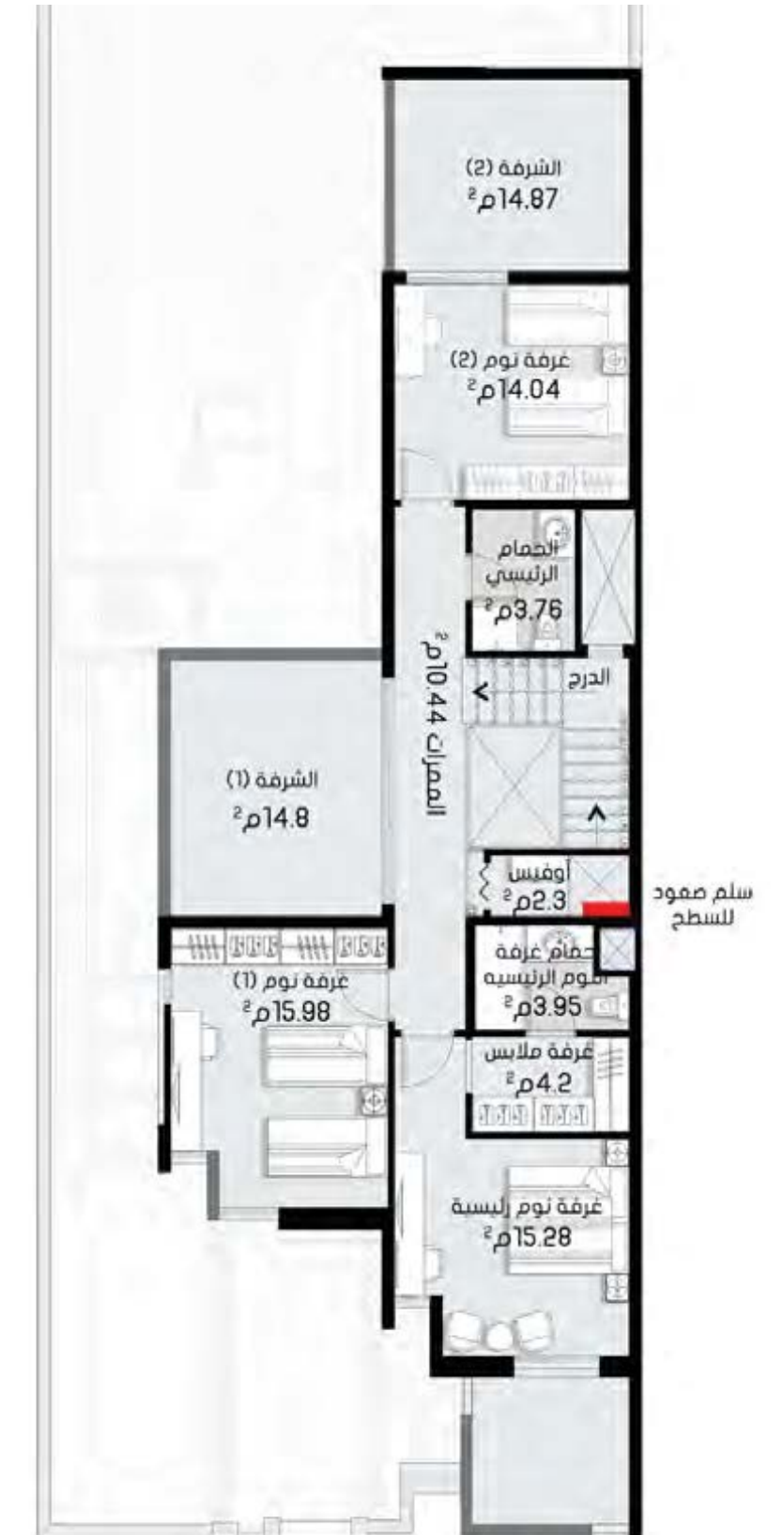
First Floor 90 m 2